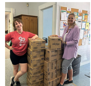
United Way Donation