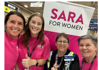
Home Sweet Home Mission RONA Fundrasier