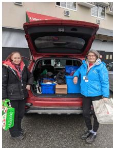
Peers in the Community