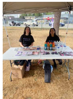
International Overdose Awareness Day Event