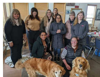
Dog Therapy Group