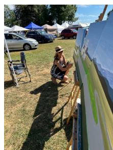
Mission Folk Fest