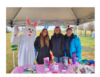
United Way Easter Egg Hunt