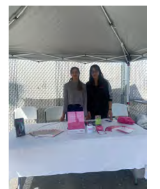
Mission Connect Event