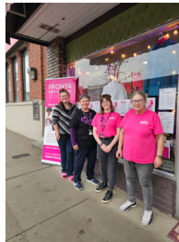
Mission Customer Appreciation Night