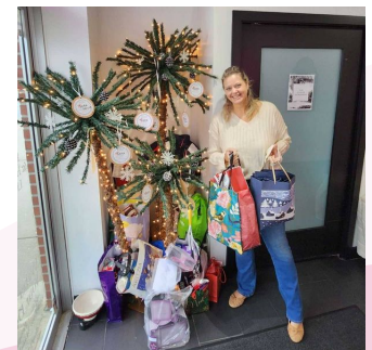
Loft Tan & Wellness Donation