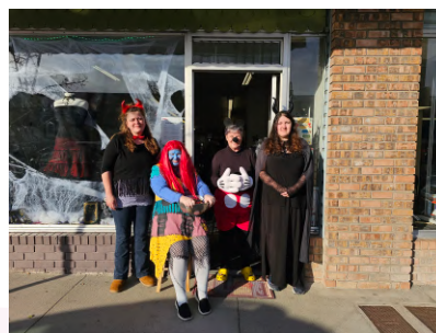
Mission Downtown Trick or Treat