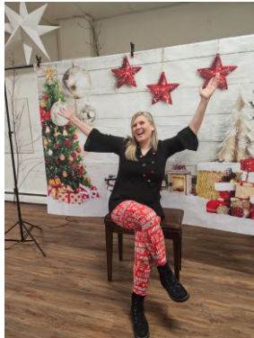
POPs Christmas Lunch