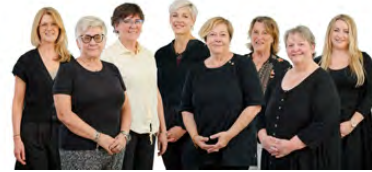
SARA's Board of Directors

IN CASE YOU MISSED OUR HOLIDAY NEWSLETTER, MAKE SURE TO CLICK HERE FOR AN INSPIRATIONAL STORY!