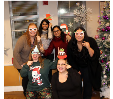
Second Stage Housing Christmas Mingle