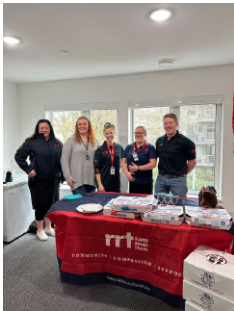
RRT North American - Food Hampers & Pizza Lunch