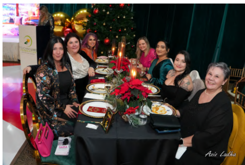
Touching Lives Foundation Fundraiser