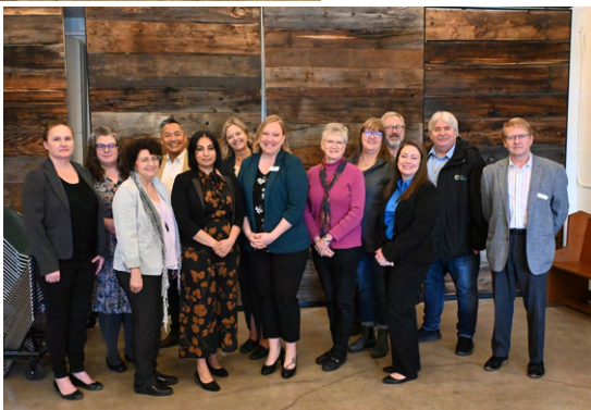
Round Table on Affordability